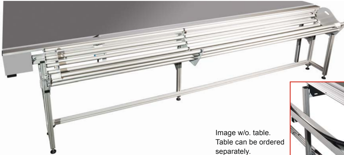
Image w/o. table. Table can be ordered separately.