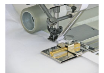
Hemstitch simply ....