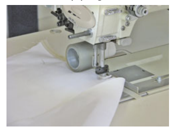
Sew on of PVC or silicone flat piping from below