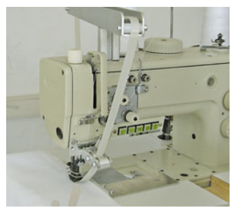
Guided Flat piping from above